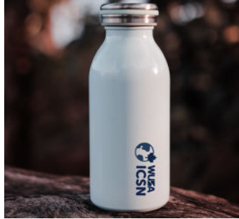
For merchandise use monochromatic logo.

Heavy use of photos to highlight events, and colour overlay.